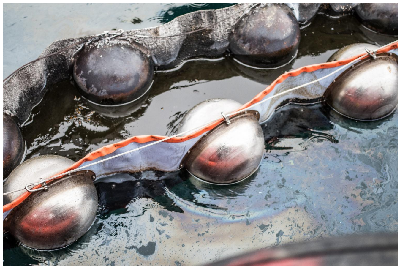
Figure 2. Picture of Desmi fireboms after termination of both burns

The fire booms were not cleaned or repaired in between the two burns and performed well for both burns, after the second burn it was however visible that the fabric was somewhat damaged from the burn, as can be seen below: